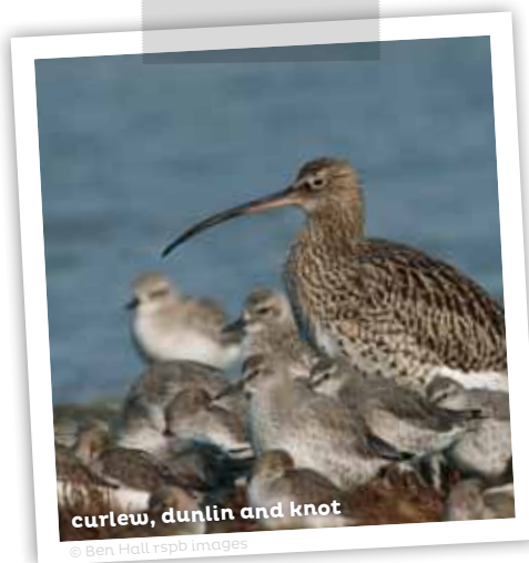
curlew, dunlin and knot